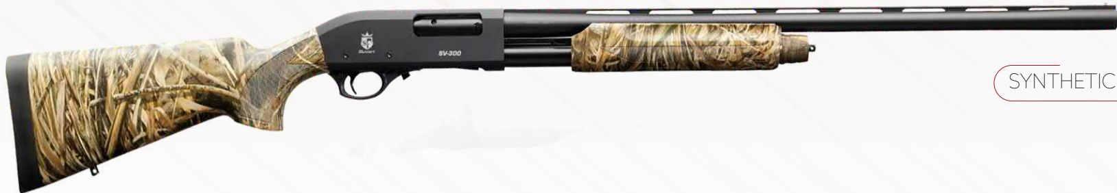
SYNTHETIC - M