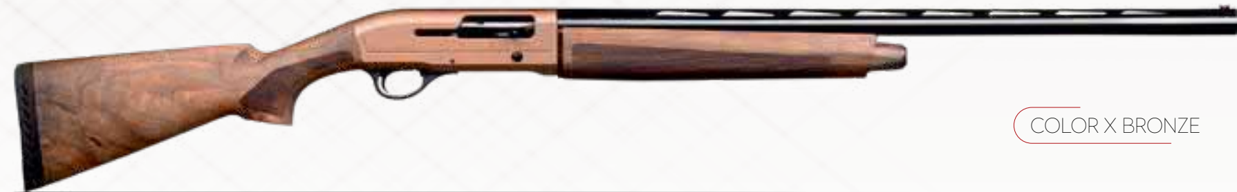
COLOR X BRONZE