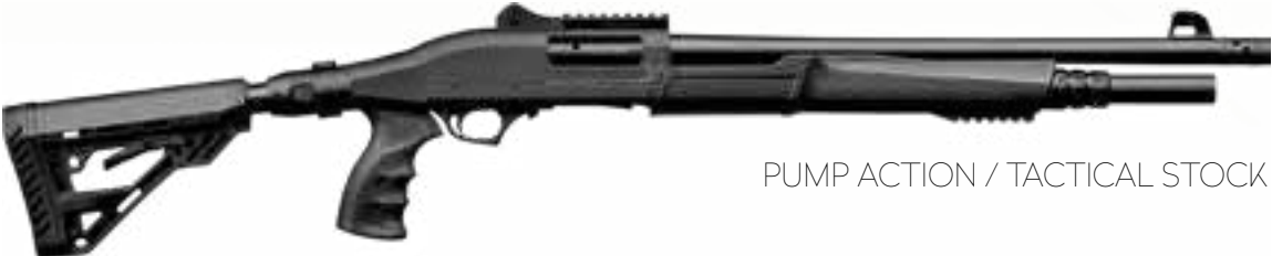
PUMP ACTION / TACTICAL STOCK