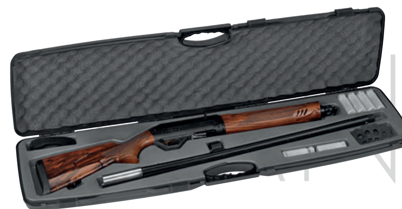
Hard Case Options