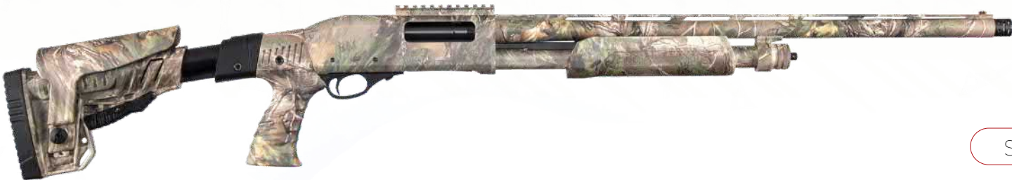
SYN CAMO PST