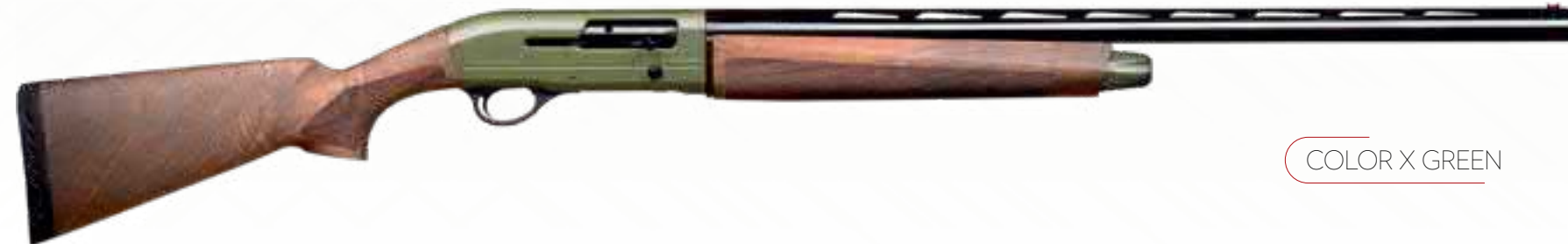
COLOR X GREEN