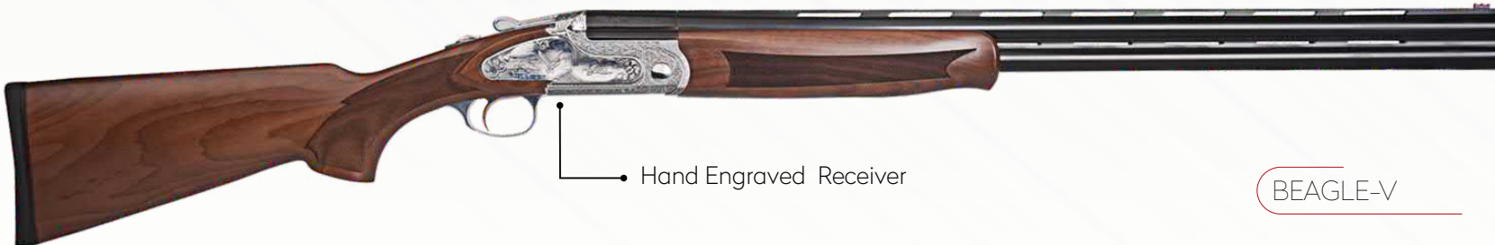
Hand Engraved Receiver