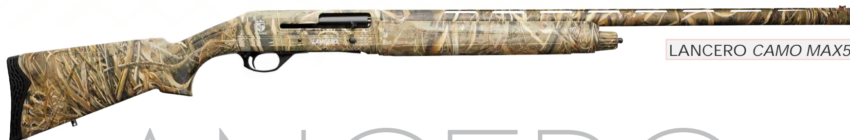
LANCERO CAMO MAX5