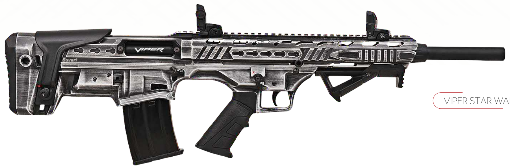
VIPER STAR WARS