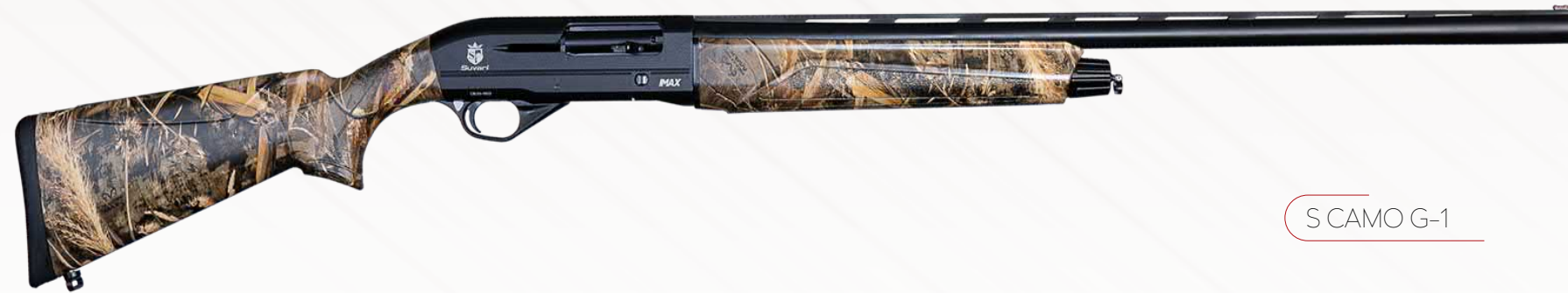
S CAMO G-1