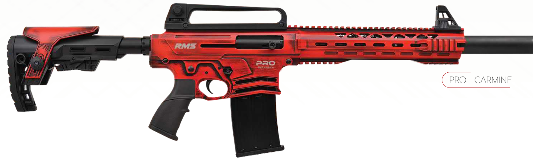
PRO - CARMINE