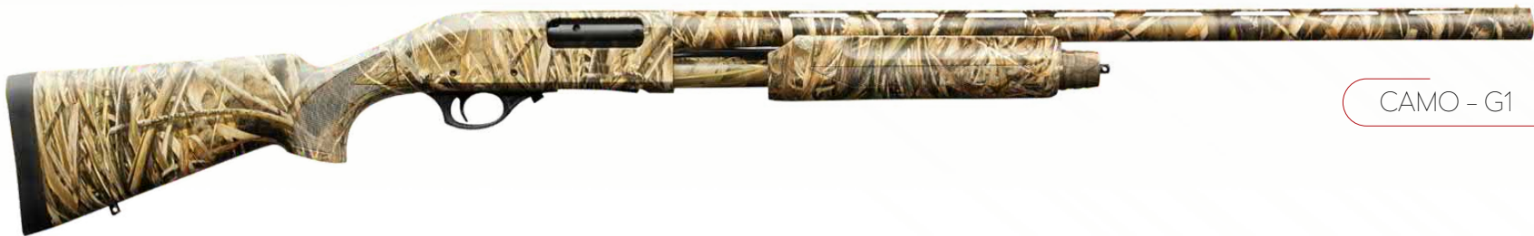
CAMO - G1