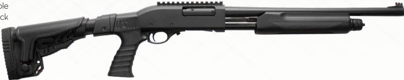
SYNETHETIC PST A1