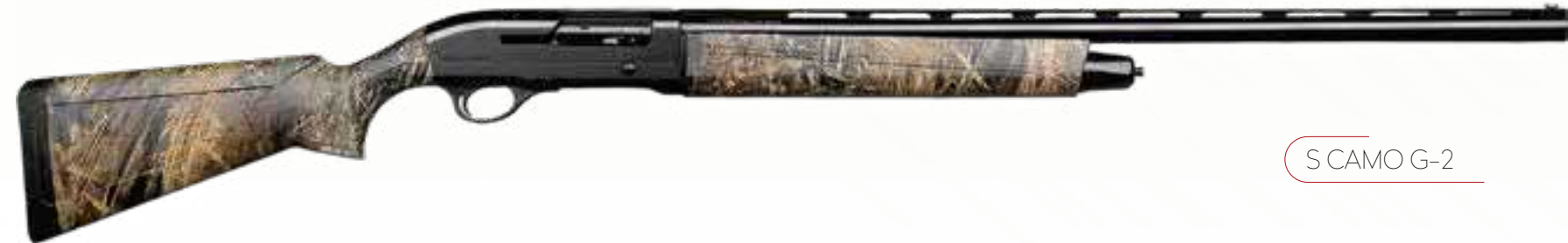
S CAMO G-2