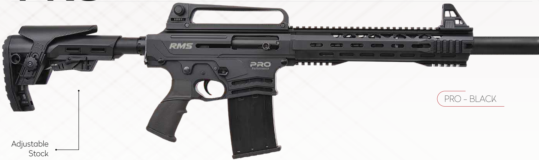
PRO - BLACK